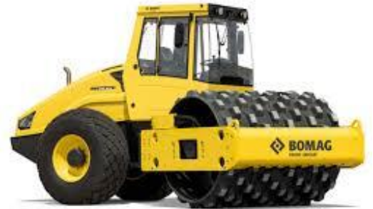
Single Drum Roller