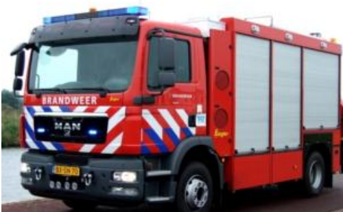
Fire Rescue Truck