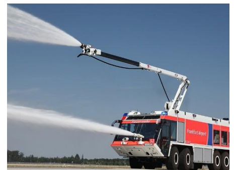
Airport Fire Rescue Truck